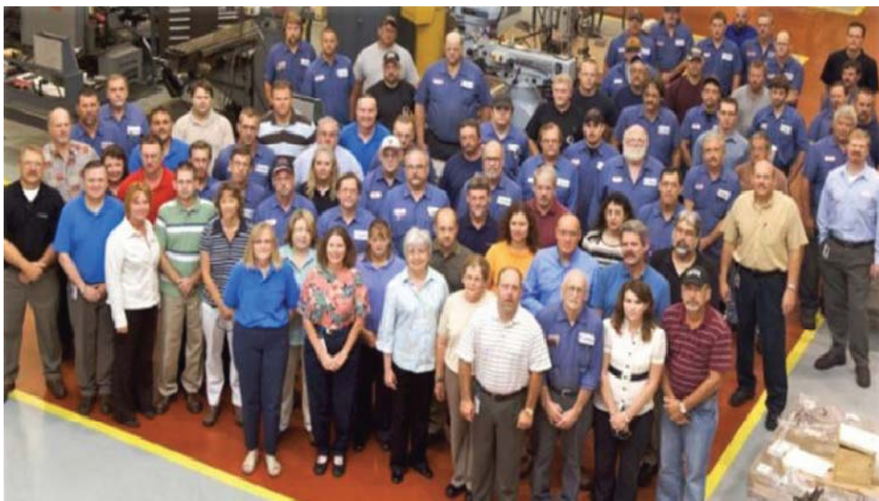
The TSI team

To learn more about our Turbocharger products, contact TSI at 800.972.7612.